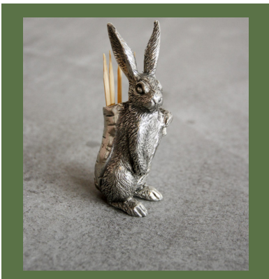
Toothpick holder with rabbit on top $40

Look below for some of our favorites from this collection!