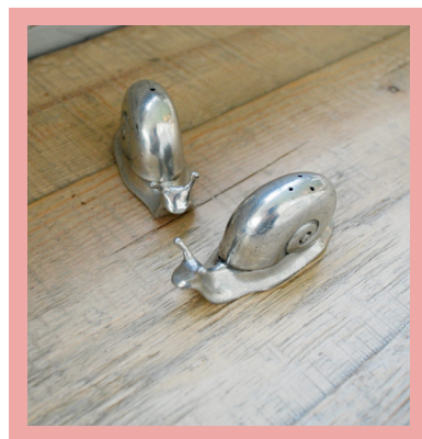
Salt and pepper shaker $70