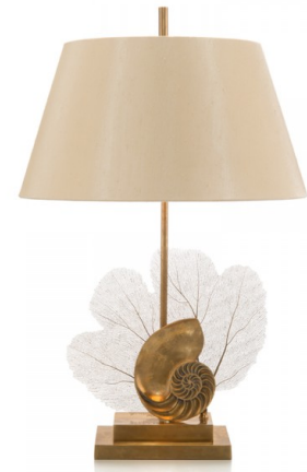
Coastal and Elegant

Are you an introvert or an extrovert? Do you find yourself making spontaneous decisions, or planning out your entire day? Did you know that your bedroom design is able to answer all those questions. Read below to find out what your bedroom says about you!