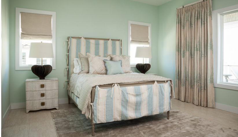
A design twist we love: with perspective, those lamps look like a heart