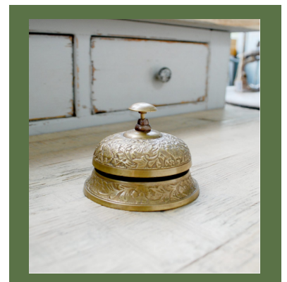
Small embossed desk bell $65