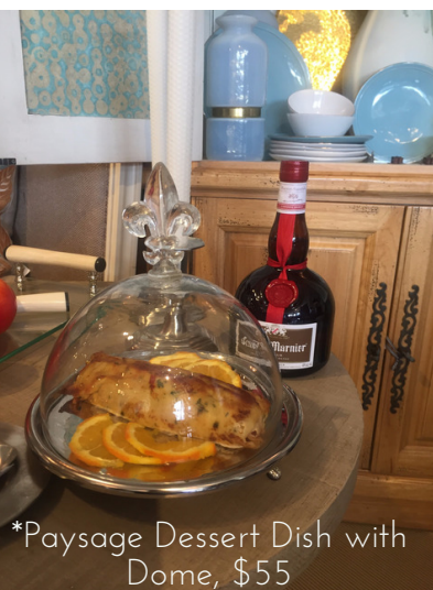
*Paysage Dessert Dish with Dome, $55

On this day, crêpes are offered in respect to purification and fecundity. In France, it has become a day where families spend time together while eating crêpes. For this month we are sharing Gigi's recipe of Crêpes au Grand Marnier!