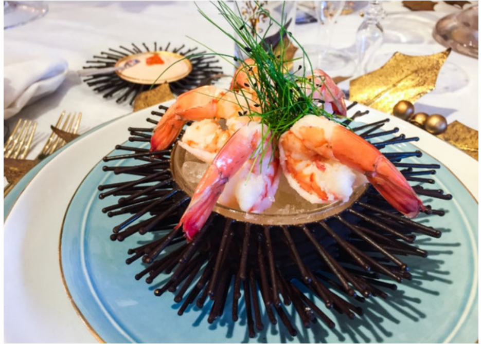
*Iron & Gold Leaf Sea Urchin (Lg, $85)

Boiled Shrimp 1/4 cup tomato paste 2 tbsp fresh lemon juice 1 tbsp sherry 3 tbsp cognac 2 garlic cloves, minced 1 small onion, minced 1/2 cup water 1 1/2 cups mayonnaise 1/2 cup sour cream At least 2 tbsp horseradish