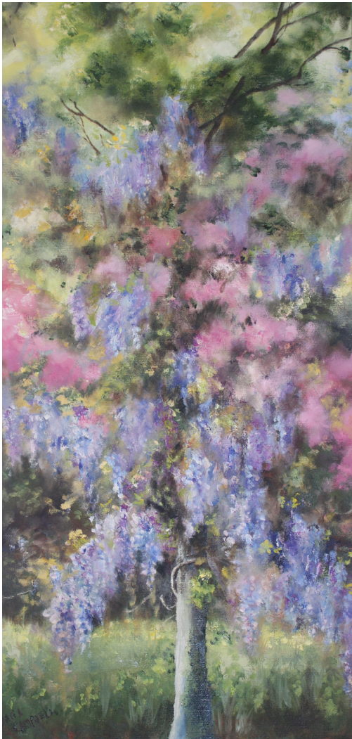
Flower Study 2 $500.00