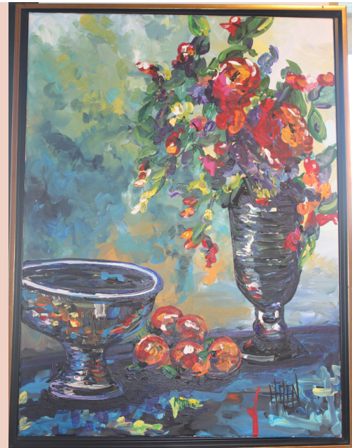
Kumquats with black vase $550.00