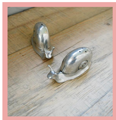
Salt and pepper shaker $70