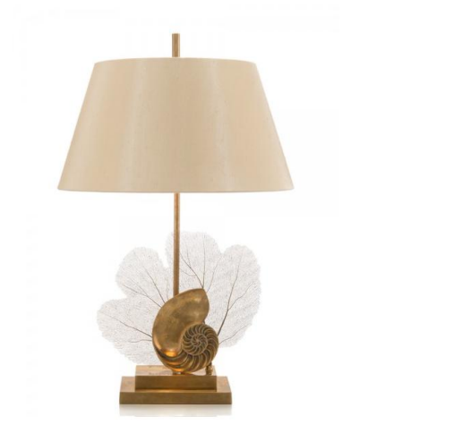
Coastal and Elegant

Are you an introvert or an extrovert? Do you find yourself making spontaneous decisions, or planning out your entire day? Did you know that your bedroom design is able to answer all those questions. Read below to find out what your bedroom says about you!