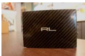
Ralph Lauren Playing Cards, $48