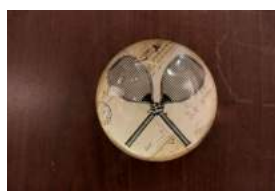
Glass Paperweight Tennis Rackets, $30