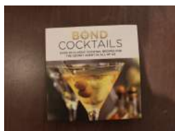
BookBond Cocktails, $9.95

CHECK OUT OUR FAVORITE FATHER'S DAY GIFTS BELOW!