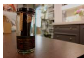
Twine & Twig Whiskey Wood, $25