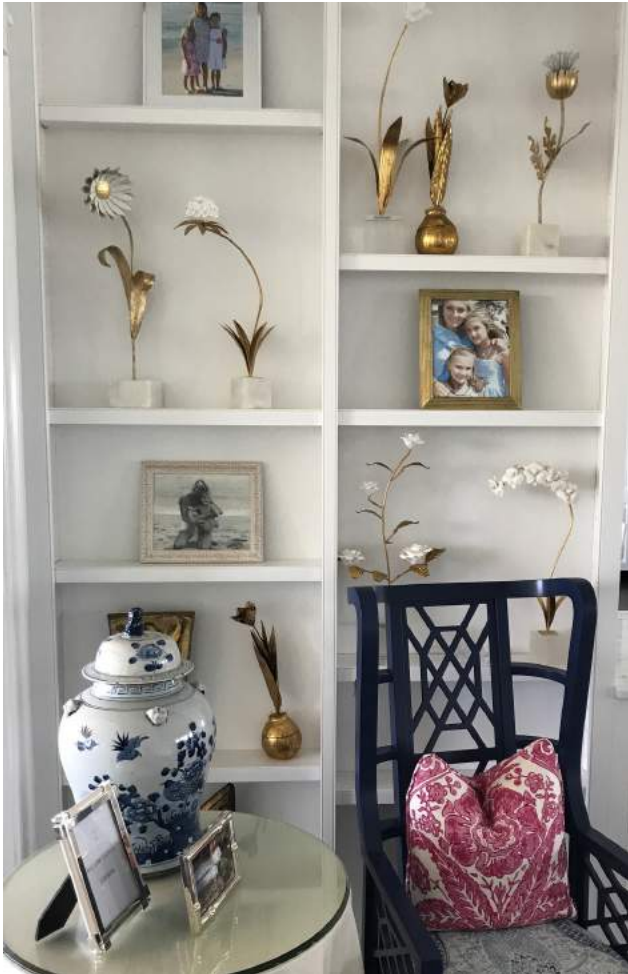
Check out this client spotlight! This is Lisa Painter's beautiful arrangement of these flowers!