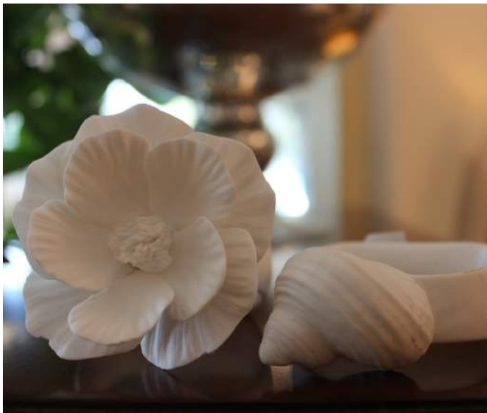
Napkin rings are the perfect addition to a table setting! You can pick up these rose napkin rings for $18.75

Livening up your home doesn't have to be expensive! Be surrounded in style with these affordable décor pieces.