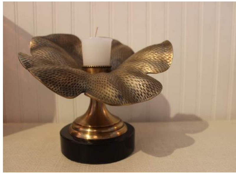
This unusual candle holder is a great home decor piece. You can add it to a mantle, book shelf, or even side table! It is available at Paysage for $295