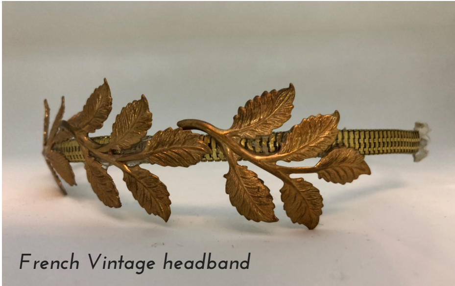
French Vintage headband

We are so excited to share our new jewelry line that is exclusive to Paysage.