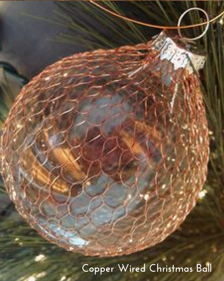
Copper Wired Christmas Ball