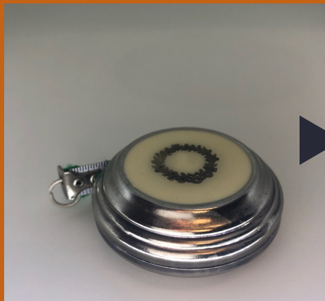
Check out this vintage-looking tape measure! Say goodbye to the standard look and pick up these from Paysage for only $16!