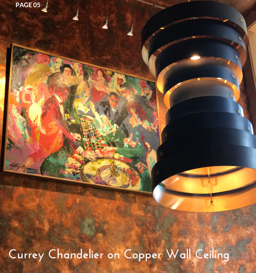
Currey Chandelier on Copper Wall Ceiling