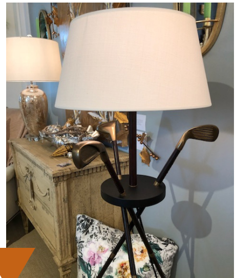
▼ Looking the perfect gift for the golf players in the family? Check out this golf club lamp! It is sure to be an attention-getter this holiday season. It could be yours for $495