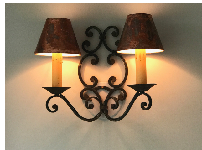
Antique Double Shade Sconce

Check out the five ways you can incorporate and curate copper in your home for the holidays!