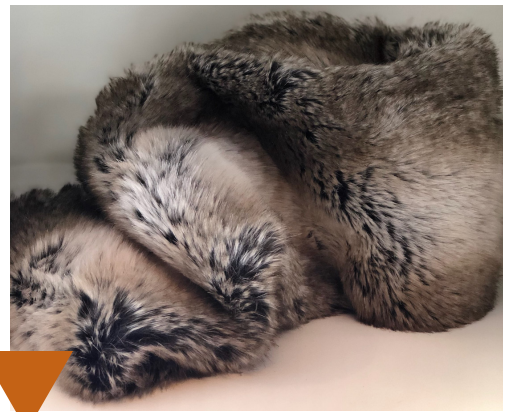
▼ Our 2017-2018 faux fur collection is selling fast! Be sure to get yours this holiday season for $69