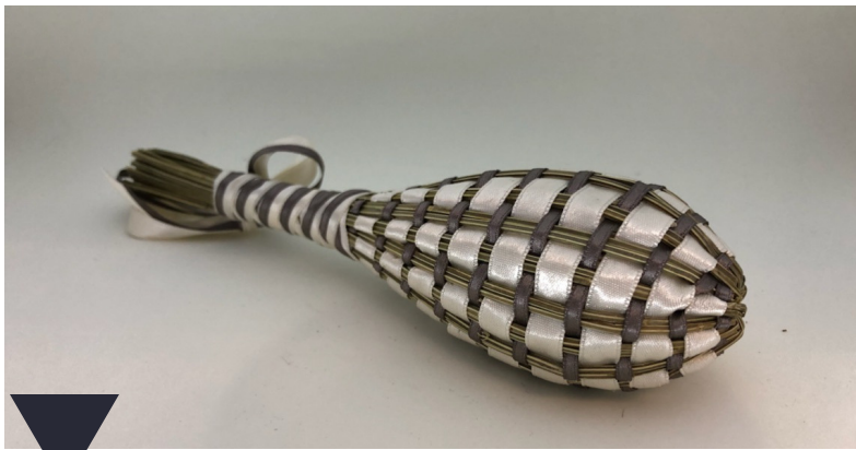
▼ This lavender wand is perfect for a warm and inviting place setting for the holidays. Get yours today for $39

Stop by Paysage to pick up the FULL 2017 Holiday Gift Guide!