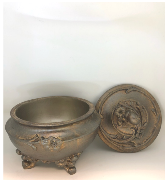
Need a place to store your accessories or kick knacks? This beautiful and intricate gold box for $29 is the perfect fit to hold anything your heart desires!