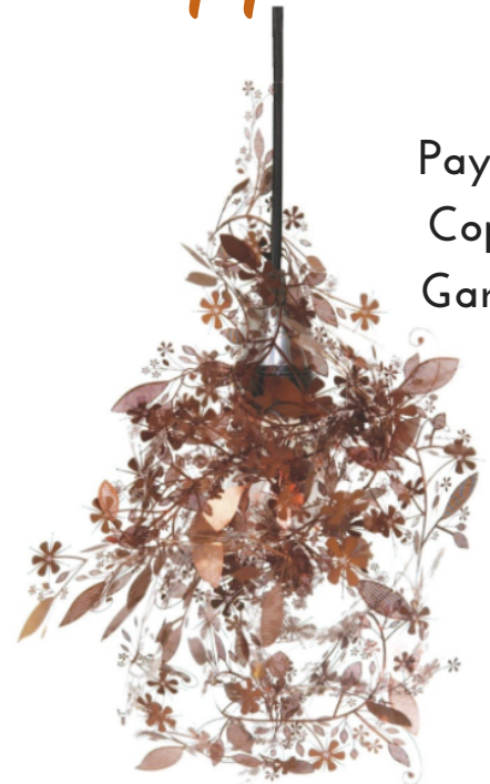
Paysage Copper Garland