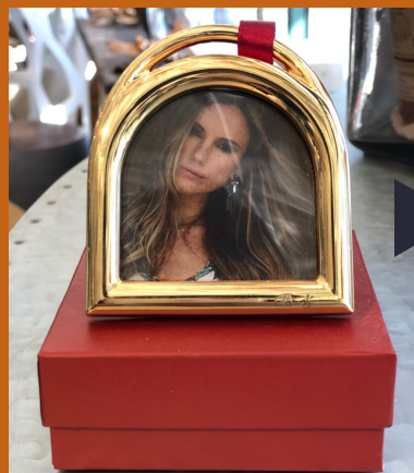
Nothing says holiday cheer more than family photos on the Christmas tree! You can get this Ralph Lauren gold hanging picture frame from Paysage for $45