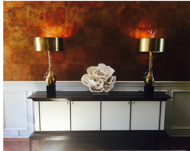
Baker Credenza Global Views Lamps

Ornaments are easily the best way to use different colors for the holidays. No matter the size, color or shape, they bring together your holiday home decor. Copper Christmas ornaments will add more liveliness to a tree. Mix with clear glass ornaments and it's magic!