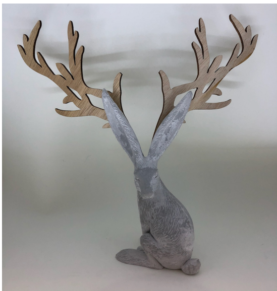
Looking to take your holiday home decor to the next level? Pick up this deer figurine from Paysage for $15

Be surrounded in style with these affordable decor pieces.