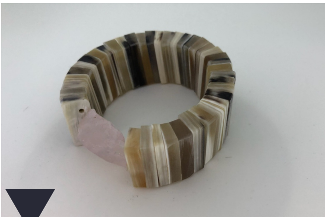
▼ Bracelets are always a great gift to give. This handmade bracelet is perfect for anyone looking for that unique piece of jewelry. It can be yours for $74