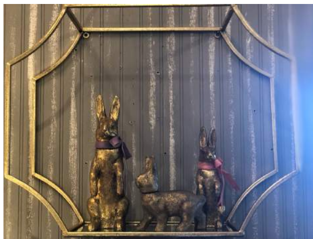
Brighten someone's day with these bunnies from Paysage. Perfect for decoration, Easter baskets and celebration! $30, $45, & $55