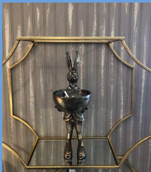
If you're looking for the perfect spring decor piece for your home, look no further! This dish stand from Paysage is perfect for candies, peppermints and so much more! $45