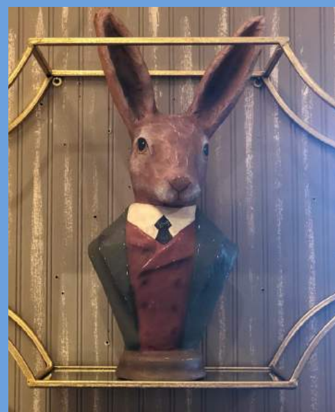
This bunny head is perfect to place upon a fireplace mantel or entryway table, $95