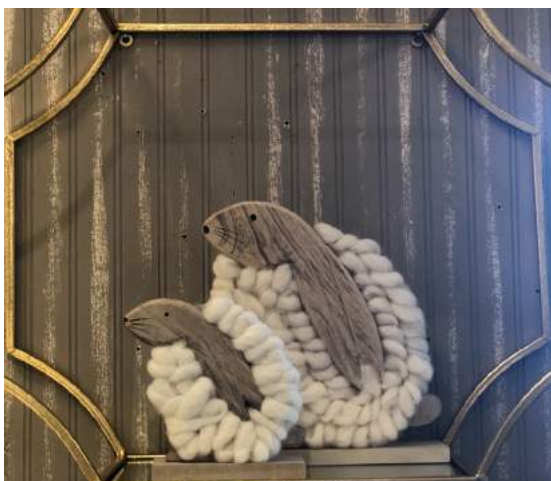
Bunnies are a great decor addition for Easter! Pick these up today at Paysage for: $10 & $21

Be surrounded in style with these affordable décor pieces.