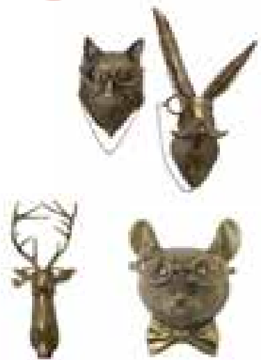
ERIC, ELOISE, FRANKIE & LOUIE WALL MOUNTS MAKE THE STORY JUMP OUT OF THE PAGE.