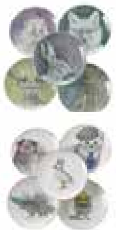
PLATE-SETS CREATE A TABLESCAPE THAT IS WHIMSICAL ENOUGH TO CAPTIVATE YOUNG, YET SOPHISTICATED ENOUGH TO DELIGHT THE GROWNUPS.

DON'T FORGET ABOUT ERIC AND ELOISE'S FOREST FRIENDS THAT JOIN THEM ON THIS MAGICAL JOURNEY-AVAILABLE IN WALL MOUNTS AND PLATE-SETS.