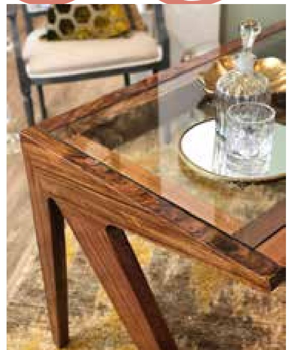
FEATURED: ROSEWOOD MID CENTURY DESK $1395.00

You can really give your desk a style upgrade by choosing a chair that is not necessarily meant to be used as a desk chair. We like to pull chairs from the dining room or a side chair from the living room or another space in the home. You can amp up the style with a nice throw on the back of the chair or even a brightly patterned throw pillow.