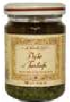
FEATURED: THE FRENCH FARM PESTO NOW AT PAYSAGE PRICE: $18.00

Ingredients and directions provided by Cuisine Actuelle (France)