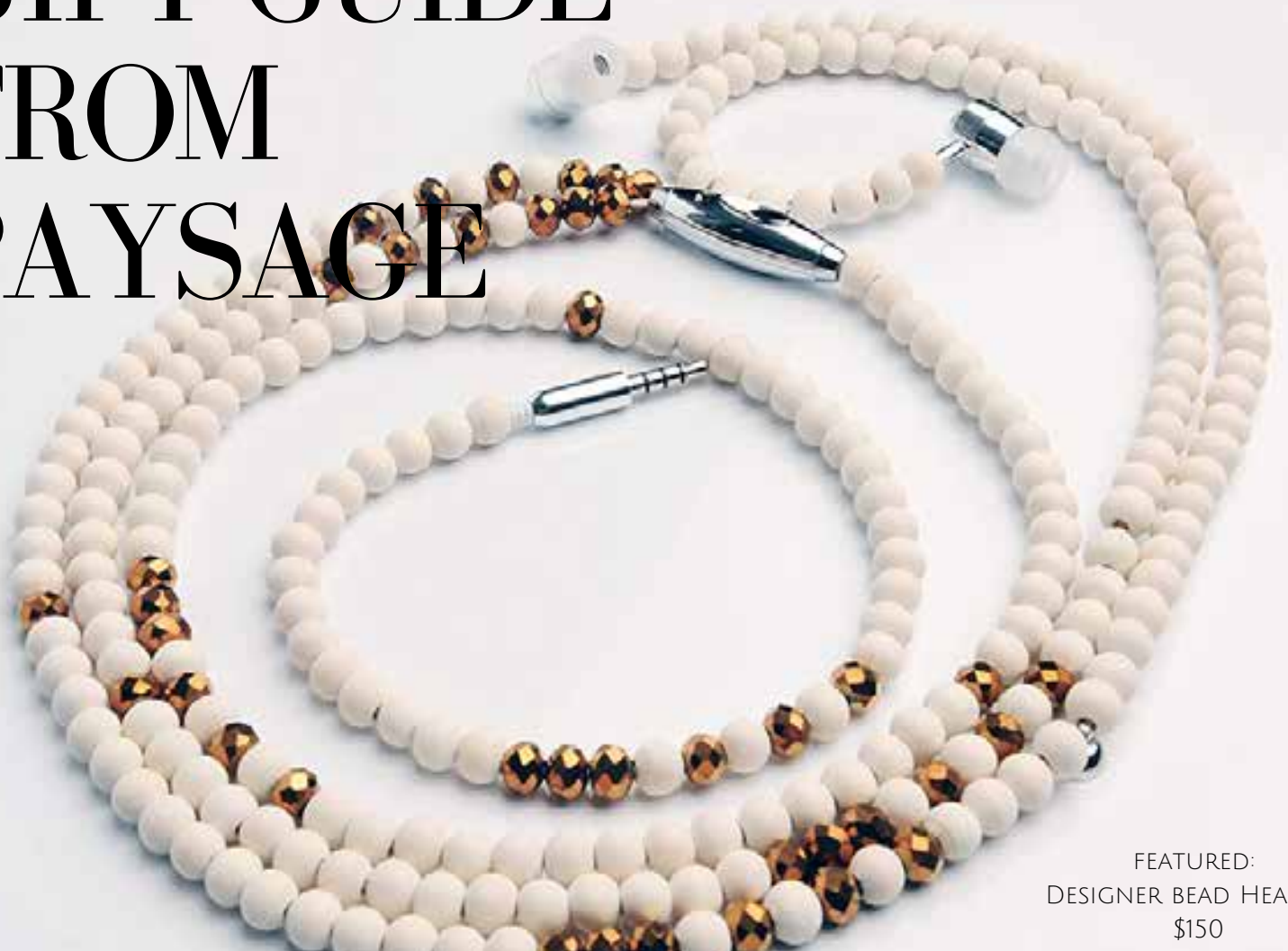
FEATURED: DESIGNER BEAD HEADSET $150