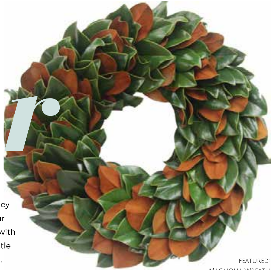
FEATURED: MAGNOLIA WREATH $350.

SUBMIT A PHOTO OF YOUR OWN FESTIVE FRONT DOOR DECOR. THE WINNER WILL RECEIVE A FREE GIFT!