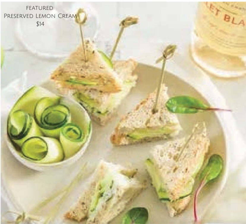
FEATURED: PRESERVED LEMON CREAM $14