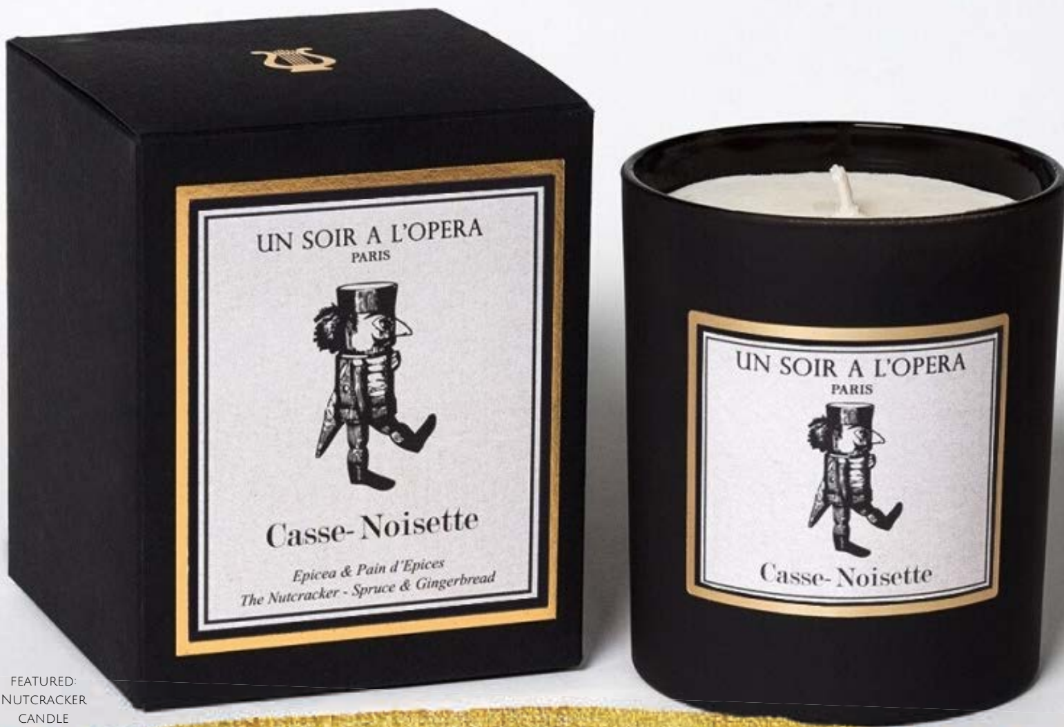
FEATURED: NUTCRACKER CANDLE $70