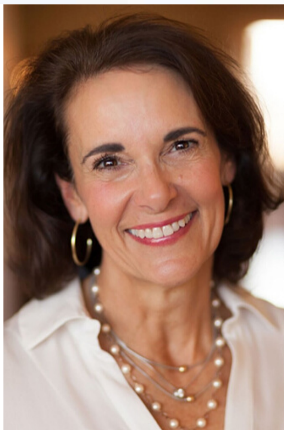
Author: DeeDee Dalrymple

The conversation continues with our Effortless Entertaining Community where you'll receive fresh ideas, new recipes and practical strategies.