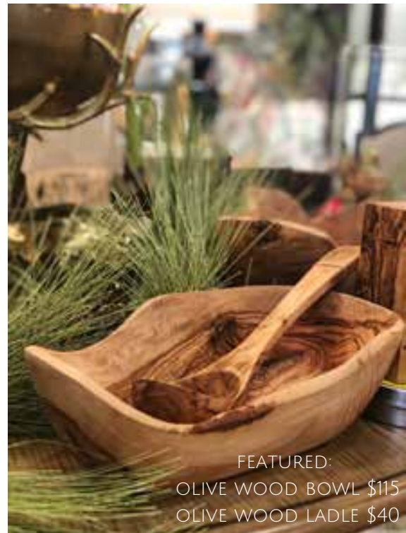
FEATURED: OLIVE WOOD BOWL $115 OLIVE WOOD LADLE $40