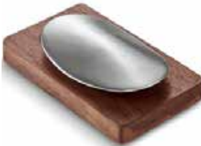
FEATURED: STAINLESS STEEL SOAP $50