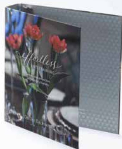
EFFORTLESS ENTERTAINING - THE GUIDE $75.00

Effortless Entertaining is an approach to hospitality that we embrace together. It's a community with many points of access. It begins with Effortless Entertaining - The Guide . Step by step you'll discover how to entertain in your home with confidence and ease.