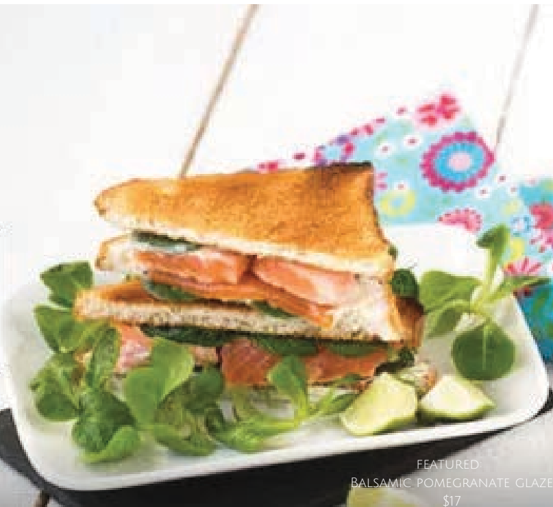
FEATURED: BALSAMIC POMEGRANATE GLAZE $17