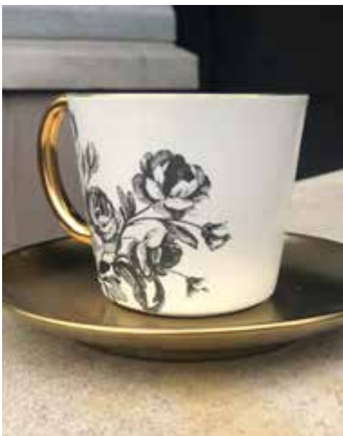
FEATURED: LITHOGRAPHIE FLORAL TEACUP & SAUCER $35

"THE FONDEST MEMORIES ARE MADE WHEN GATHERED AROUND THE TABLE"