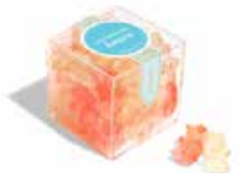
CHAMPAGNE GUMMY BEARS $10