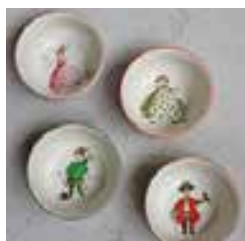
FEATURED: COSTUME CHILDREN PLATES: $18 BOWLS: $14 CUPS: $10