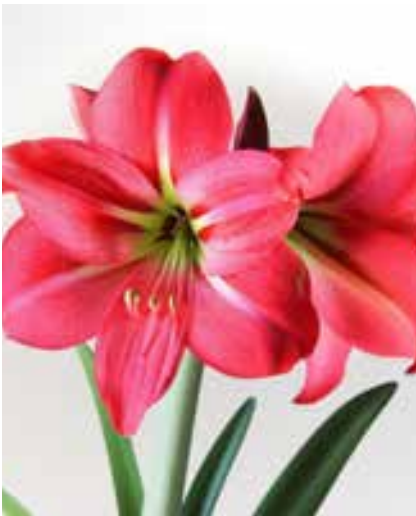
AMARYLLIS BULBS $20 FORCING JARS $32