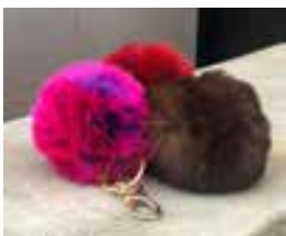
FUR KEY CHAINS $50