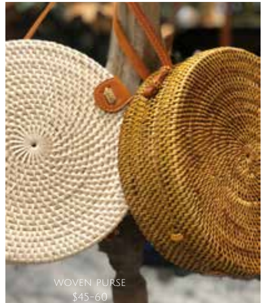
WOVEN PURSE $45-60