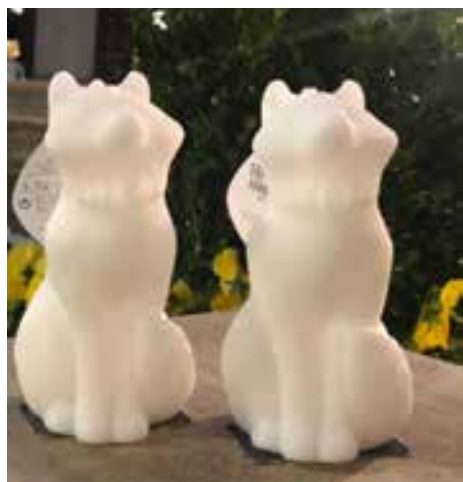
FEATURED: WHITE WOLF CANDLES FROM FRANCE $28