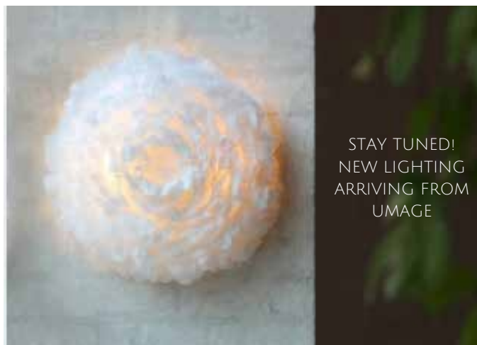
STAY TUNED! NEW LIGHTING ARRIVING FROM UMAGE