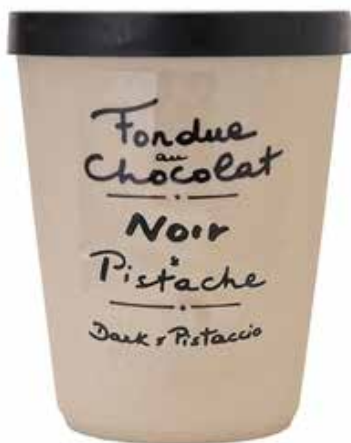
FEATURED: AUX ANYSETIERS DU ROY DARK CHOCOLATE & PISTACHIO FONDUE $29