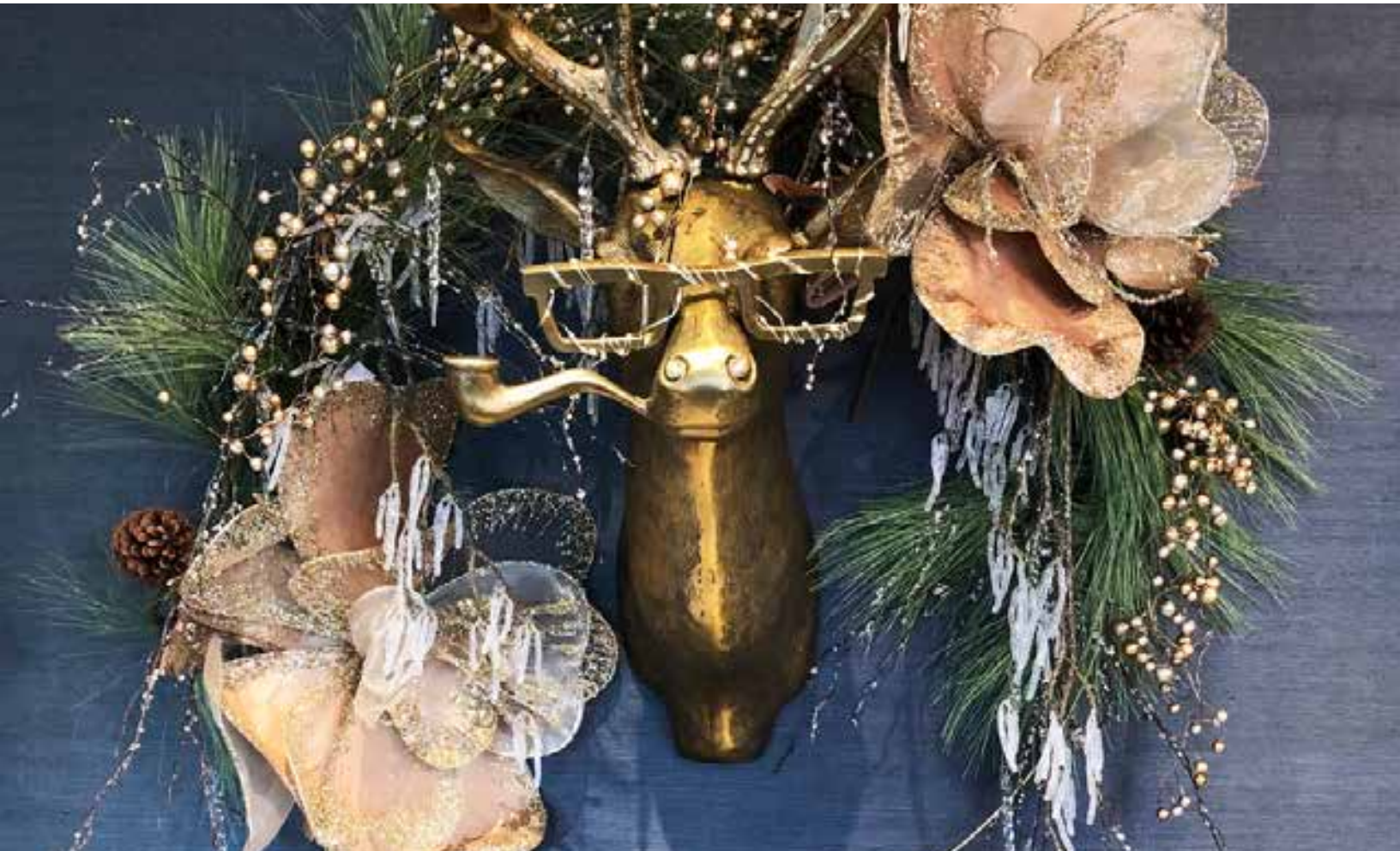
FEATURED: FRANKIE WALL MOUNT $550