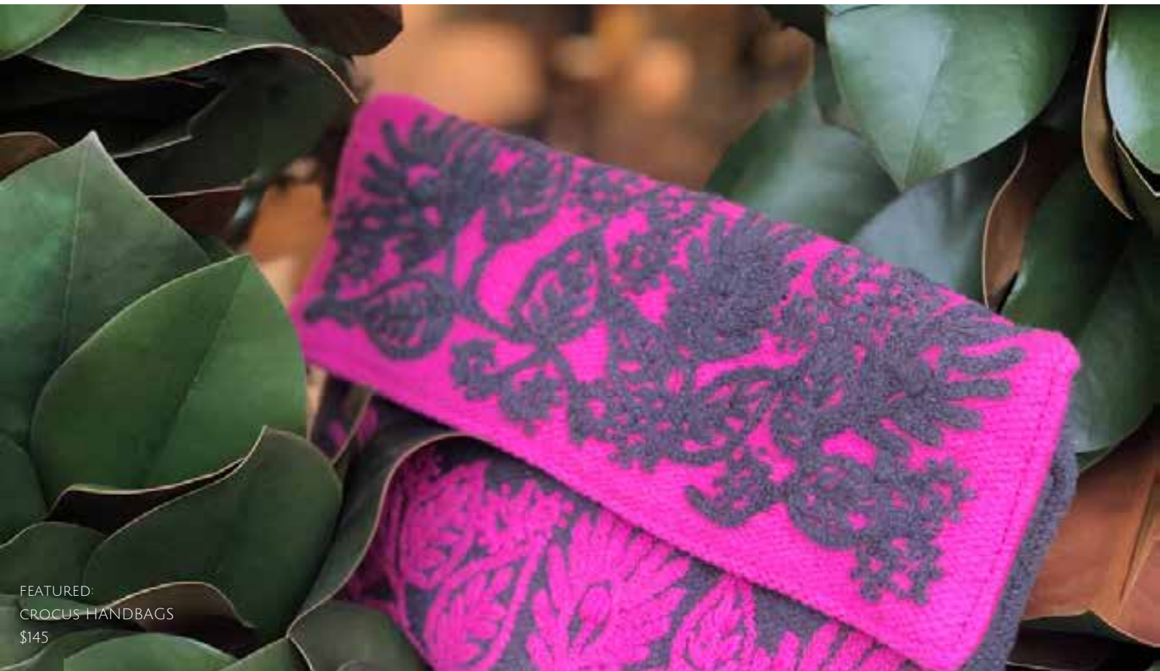
FEATURED: CROCUS HANDBAGS $145