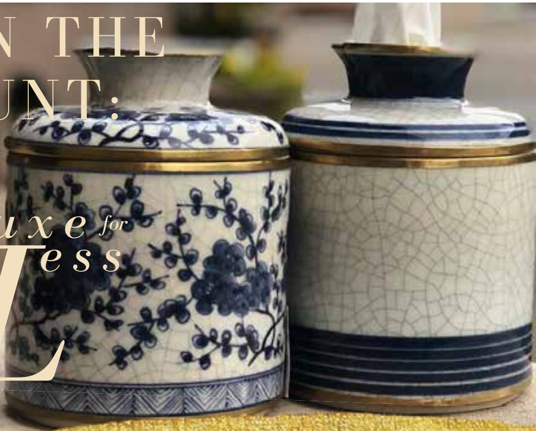
FEATURED: CERAMIC TISSUE BOX $145