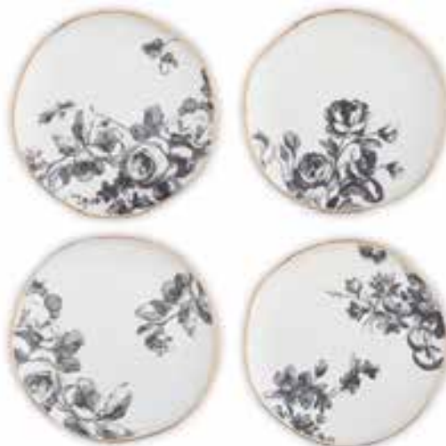
FEATURED: LITHOGRAPHIE FLORAL PLATES $15 EACH