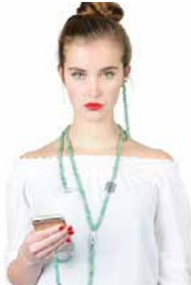
DESIGNER EARBUDS: $150-$210 FEATURED (JADE)