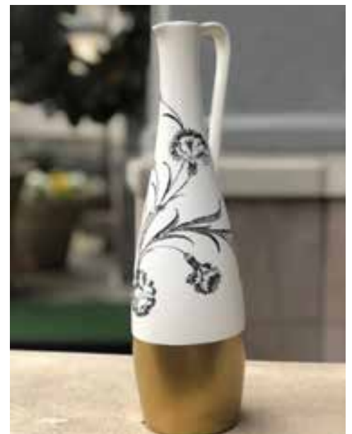
FEATURED: LITHOGRAPHIE FLORAL PITCHER $70