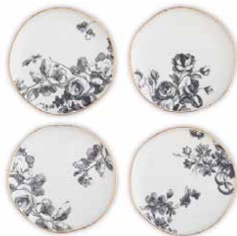
FEATURED: COMING HOME $35