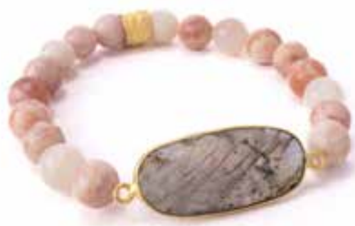
ROSE STONE BRACELET $75