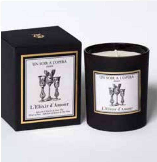
FEATURED: 6.3 OZ CANDLE $70

The Elixir of Love is a comic opera in two acts by Gaetano Donizetti. The opera premiered on May 12, 1832 at the Teatro della Canobbiana in Milan. Like Tristan and Iseult drinking the love potion that link them forever to each other, Nemorino would like to obtain this precious elixir to seduce the beautiful Adina. This potion with notes of tea, woody and spicy will help him to fulfill his dreams and to marry the woman he loves.