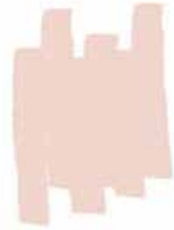
PANTONE 13-1404 Pale Dogwood