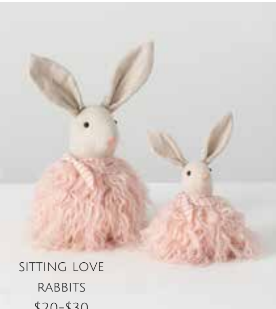
SITTING LOVE RABBITS $20-$30