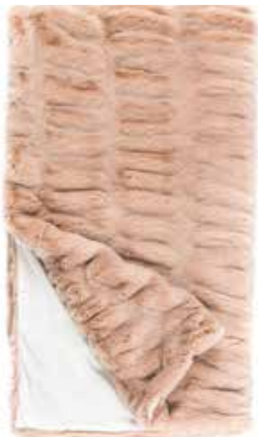
ROSE FUR THROW $375