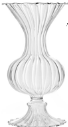
Addie Vase $12