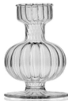
Bouquet Vase $12