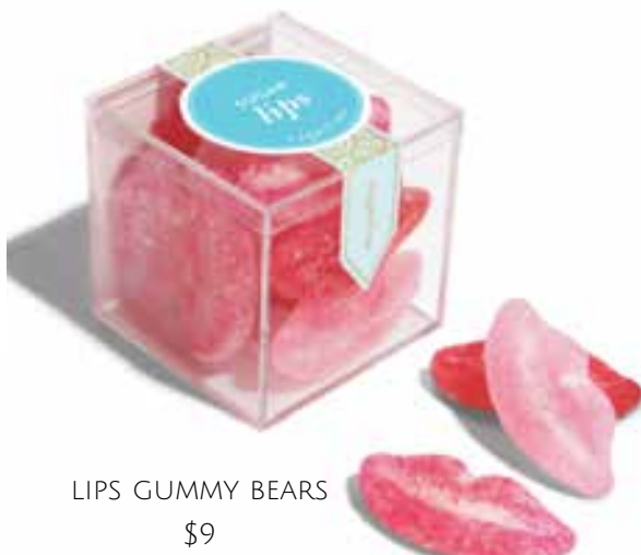
LIPS GUMMY BEARS $9