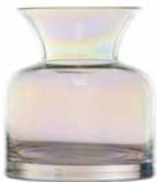
Fairy Vase $18