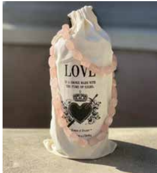
ROMEO & JULIET INSPIRED "LOVE" CANDLE $60