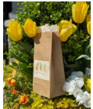
EASTER CARDS ONLY 6 LEFT! $7