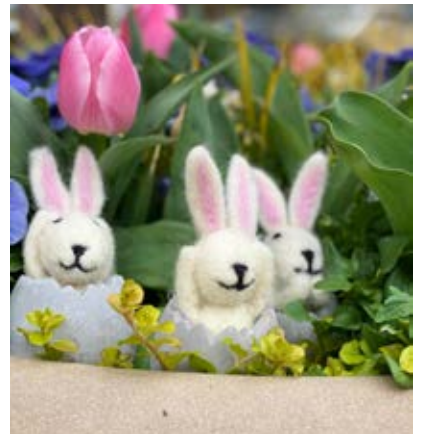
HEAR NO, SEE NO, SPEAK NO BUNNIES ONLY 2 SETS LEFT! $25/SET