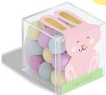
EASTER CANDIES $11/EACH