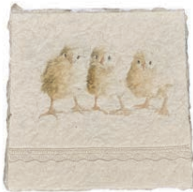
EASTER CARDS ONLY 6 LEFT! $6