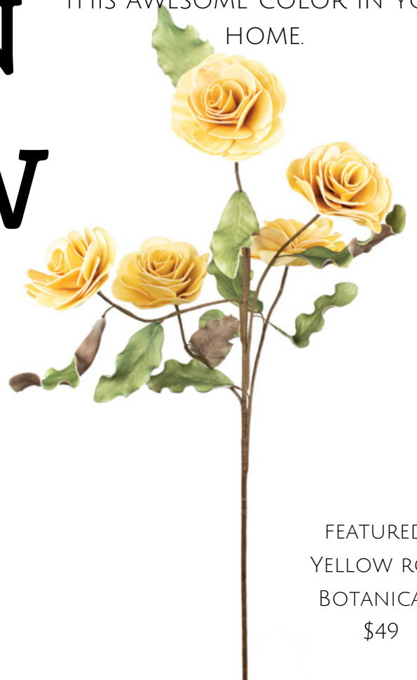
FEATURED: YELLOW ROSE BOTANICALS $49

WE LOVE TO HELP! CALL THE STORE TO SPEAK WITH ONE OF OUR DESIGNERS FOR TIPS ON HOW TO INCORPORATE THIS AWESOME COLOR IN YOUR HOME.