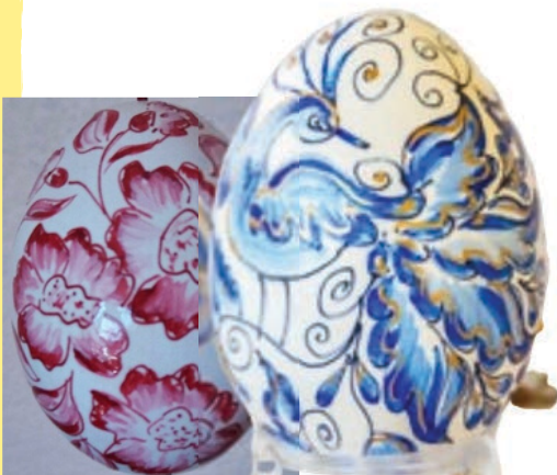
HAND PAINTED EASTER EGGS $22