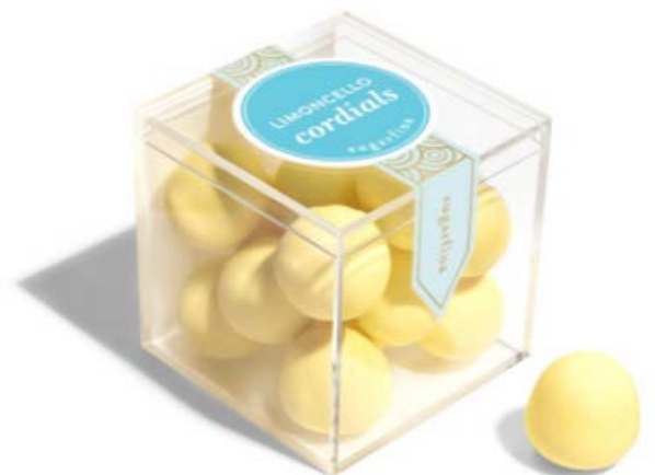
FEATURED: LEMONCELLO CORDIALS $11