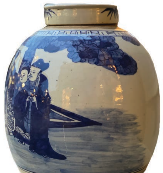
FEATURED: BLUE & WHITE JAR $175