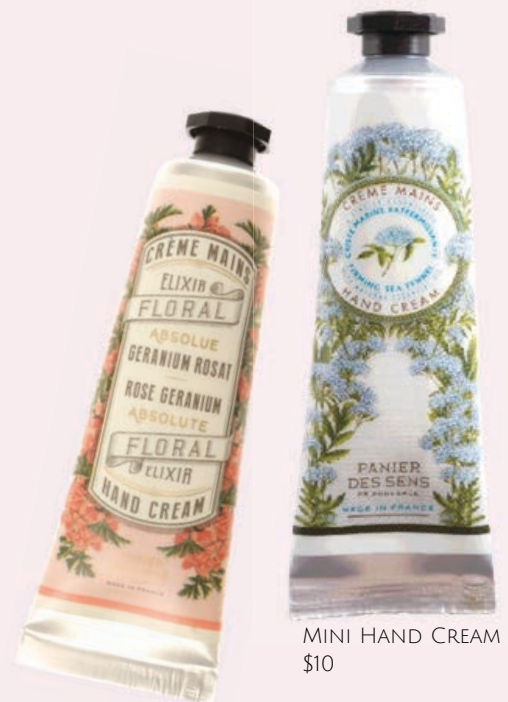
MINI HAND CREAM $10