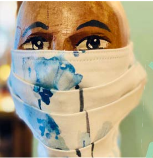
FACE MASKS $15