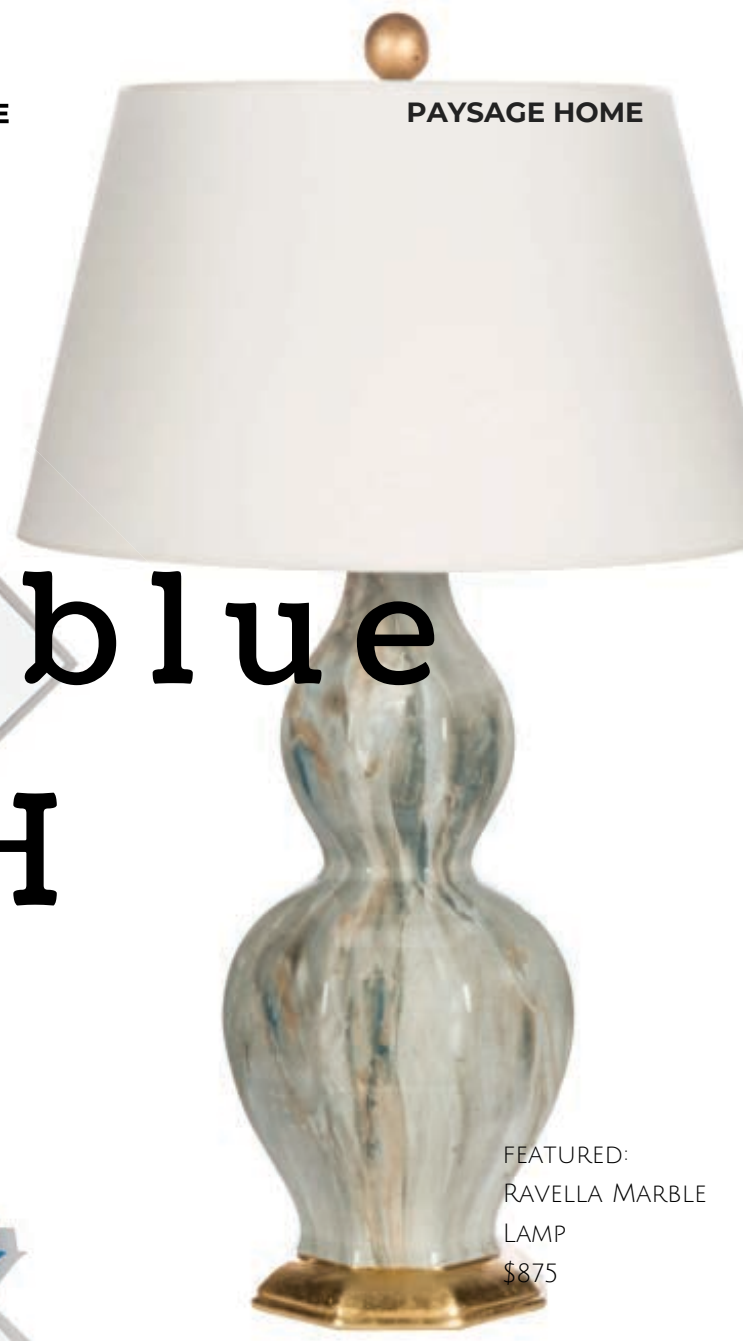
FEATURED: RAVELLA MARBLE LAMP $875

THE TEAL MOSAIC BLUE DISPLAYS AN AIR OF MYSTIQUE, GRACE AND DEPTH OF FEELING. SOLID AND STRONG, ETERNALLY TIMELESS ASH CONVEYS A MESSAGE OF LONGEVITY.