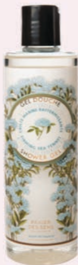
SHOWER GEL $18

They select the best of Provence, blend of modern science with the age-old wisdom and the tradition of the past to refine soft textured and delicately scented products.