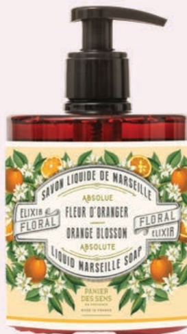
LIQUID MARSEILLE SOAP $20