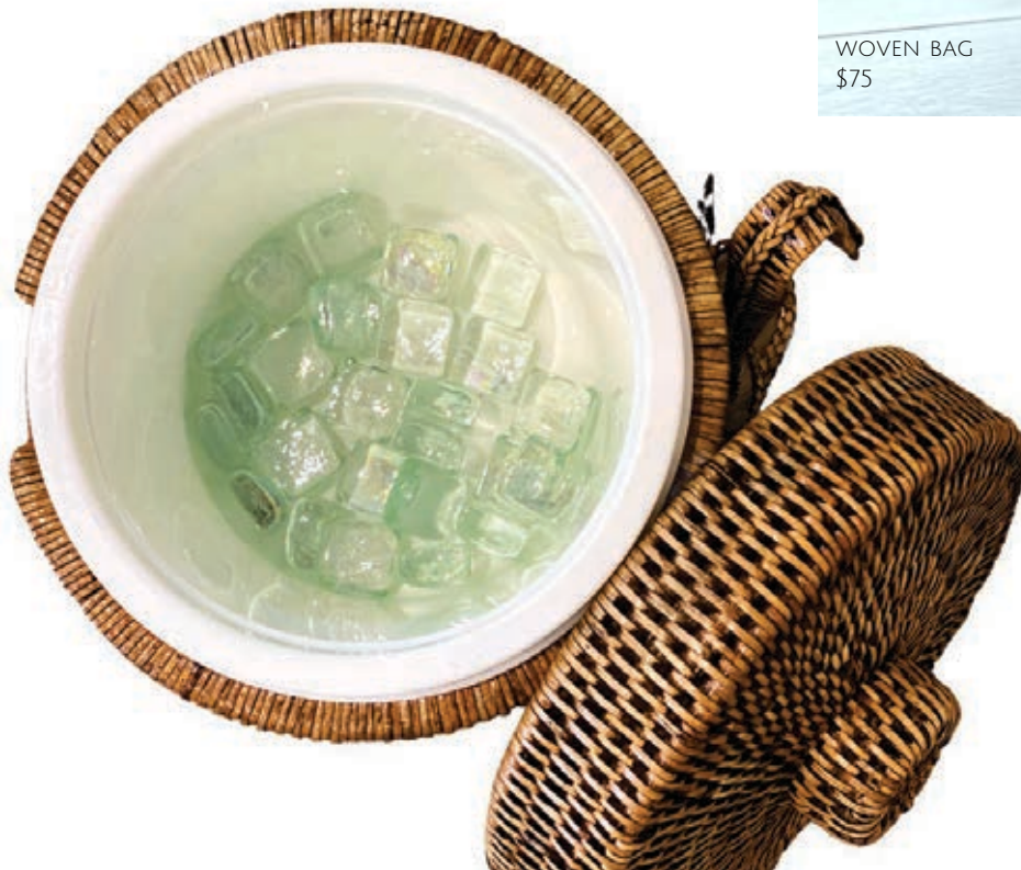
RATTAN ICE BUCKET $99

We found some fun summer essentials that you'll just love this year! Whether it's for cocktail hour, the perfect bag for a beach day, or snuggling up on the couch after a day full of sunshine, Paysage Home has it all for you!