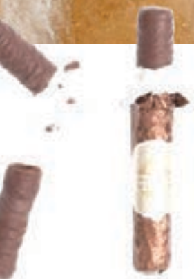
CHOCOLATE CIGAR $12