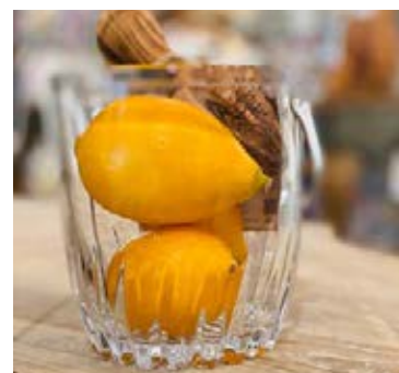
OLIVE WOOD LEMON JUICER $25