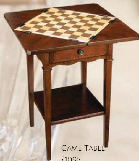
GAME TABLE $1095