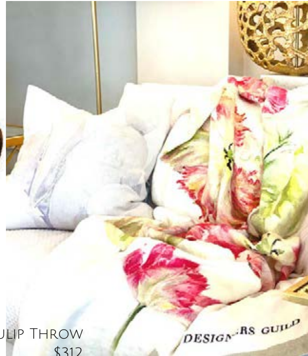
DESIGNERS GUILD TULIP THROW $312