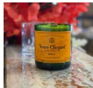
VEUVE CANDLE $50