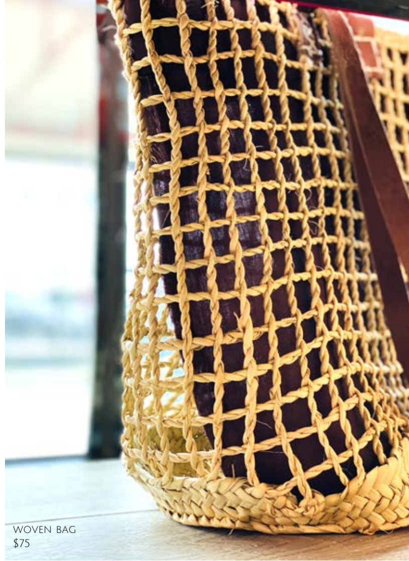
WOVEN BAG $75